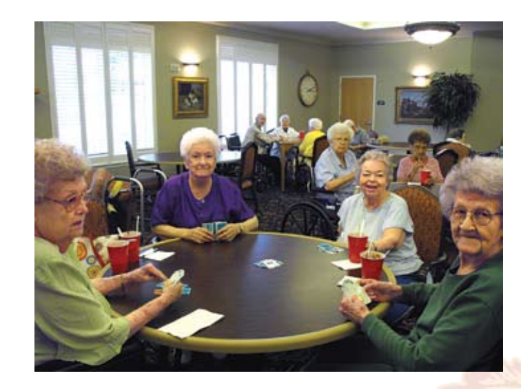
Day Room activities