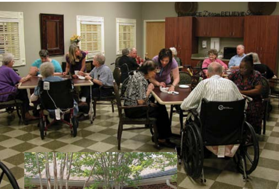
Arts and crafts