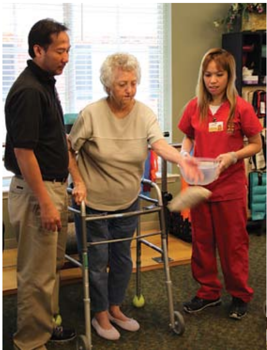
Rehabilitation and Fitness Gym