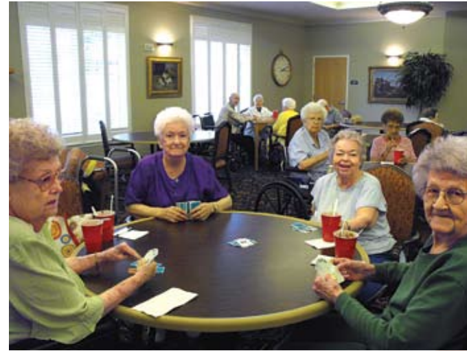
Day Room activities